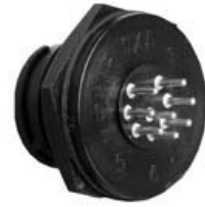
P/C Tail Panel Mount 4XXX-XXB-XXX Matching Mates: • Cable Pin 3X8X-XPB-XXX • Cable Socket 3X8X-XSB-XXX