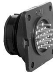
P/C Tail Panel Mount 14XXX-XXXG-XXX Matching Mates: • Cable Pin 13X8X-XXPG-XXX • Cable Socket 13X8X-XXSG-XXX